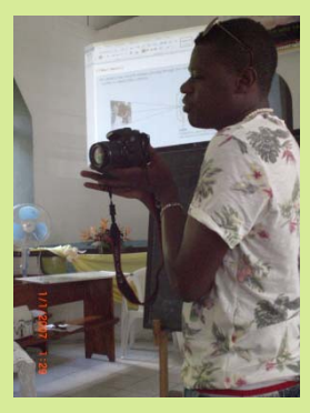
Learning the shots.

It was hard to understand the rules of photography but we were all eager to