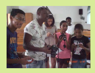
Student-teacher moment.

to be photo journalists so we asked questions. We did not hesitate to try taking different shots of each other.