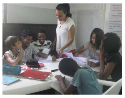
Having fun at writing class.

It will take us a while to get there but hey... we are still growing