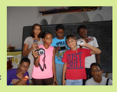
Proud Photojournalists.

"Next time I will teach them how to take photos when there are movements going on...we will throw balls and jump and take photos of these actions.. it will be fun!' said Ronny