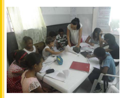
Building the story structure.

It takes a lot of discipline to be writers.