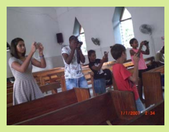
Photographers in action!

A picture is worth a thousand words. The Victoria pathfinders with cameras playing paparazzi during our photography class is certainly worth a thousand words!