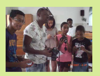
Student-teacher moment.

to be photo journalists so we asked questions. We did not hesitate to try taking different shots of each other.