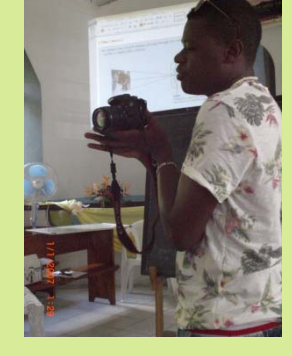
Learning the shots.

It was hard to understand the rules of photography but we were all eager to