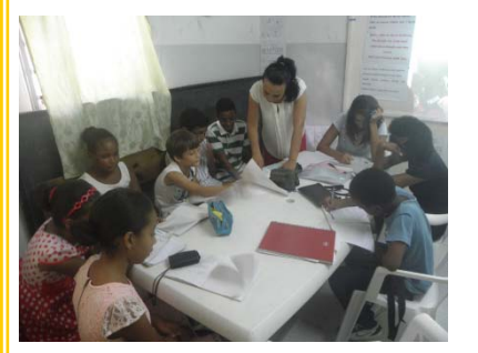
Building the story structure.

It takes a lot of discipline to be writers.