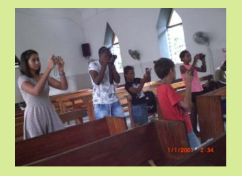
Photographers in action!

A picture is worth a thousand words. The Victoria pathfinders with cameras playing paparazzi during our photography class is certainly worth a thousand words!