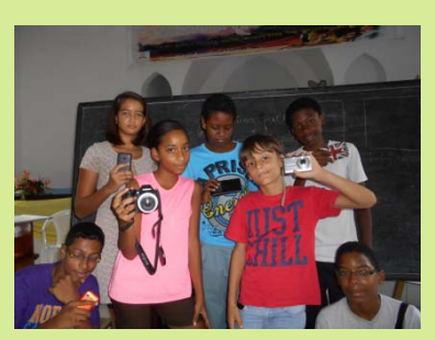
Proud Photojournalists.

"Next time I will teach them how to take photos when there are movements going on...we will throw balls and jump and take photos of these actions.. it will be fun!' said Ronny